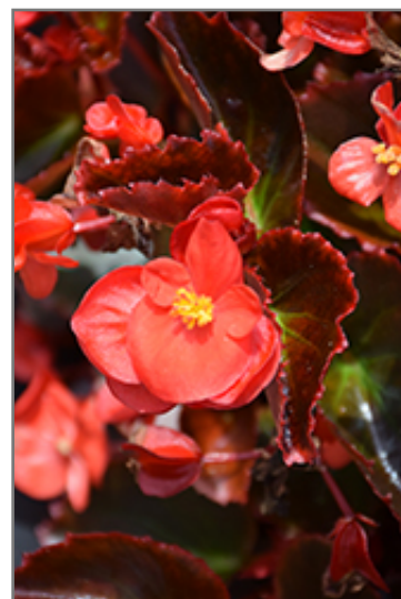
Senator IQ Scarlet flowers

Senator IQ Scarlet is recommended for the following landscape applications;