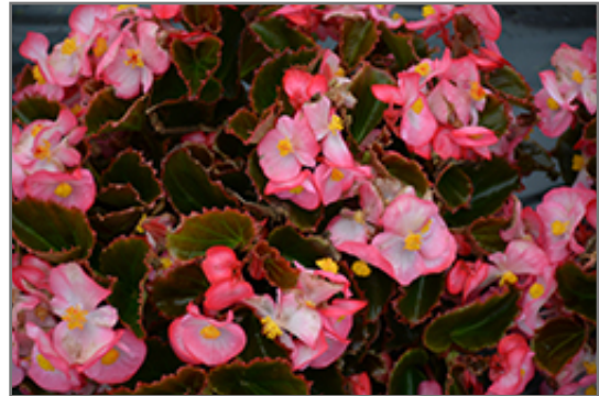
Senator IQ Rose Bicolor flowers

Senator IQ Rose Bicolor is recommended for the following landscape applications;