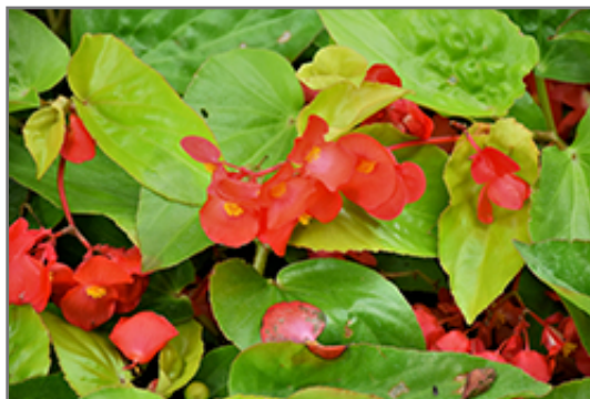
Canary Wings Begonia flowers