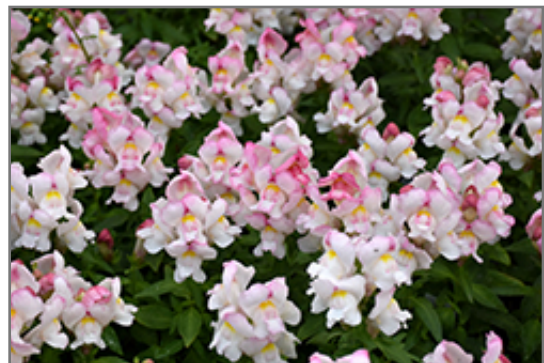
Snapshot Appleblossom Snapdragon flowers