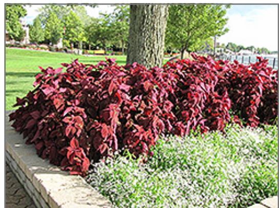
ColorBlaze Rediculous Coleus