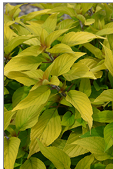
Rockin' Golden Delicious foliage