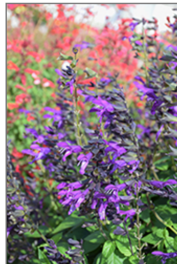
Purple & Bloom Sage flowers

Purple & Bloom Sage is recommended for the following landscape applications;