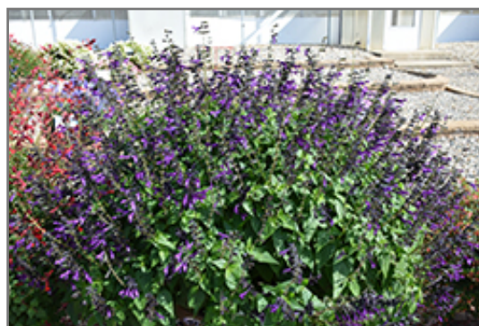
Purple & Bloom Sage in bloom