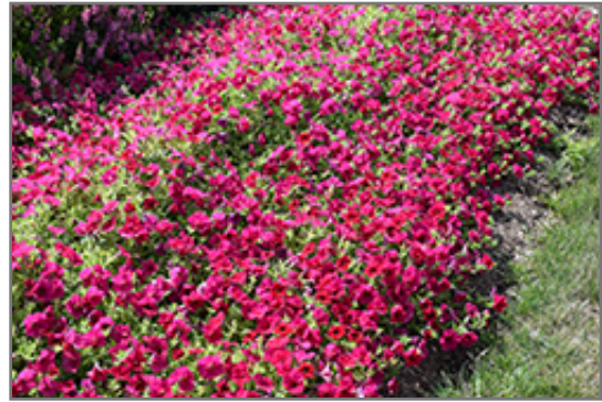
Wave Carmine Velour Petunia in bloom

Wave Carmine Velour Petunia will grow to be about 7 inches tall at maturity, with a spread of 3 feet. When grown in masses or used as a bedding plant, individual plants should be spaced approximately 24 inches apart. Its foliage tends to remain low and dense right to the ground. This fast-growing annual will normally live for one full growing season, needing replacement the following year.