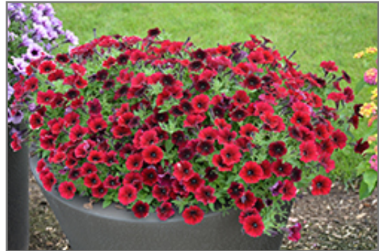
Supertunia Black Cherry Petunia in bloom

Supertunia Black Cherry Petunia will grow to be about 10 inches tall at maturity, with a spread of 24 inches. When grown in masses or used as a bedding plant, individual plants should be spaced approximately 16 inches apart. Its foliage tends to remain low and dense right to the ground. This fast-growing annual will normally live for one full growing season, needing replacement the following year.