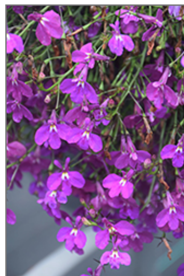
Laguna Ultraviolet Lobelia flowers