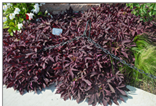
Sweet Caroline Red Hawk Sweet Potato Vine