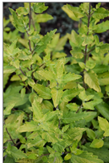
Gold Crest Caryopteris foliage

Gold Crest Caryopteris is recommended for the following landscape applications;