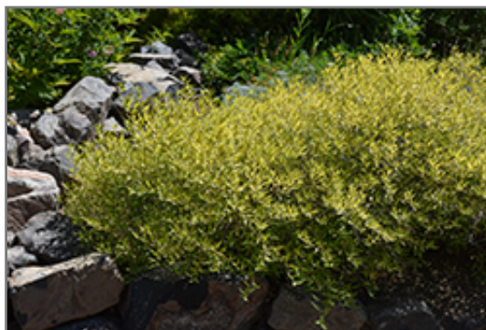
Gold Crest Caryopteris