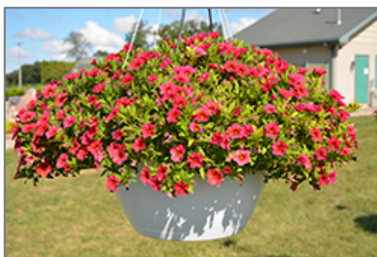
Superbells Tabletop Red Calibrachoa in bloom