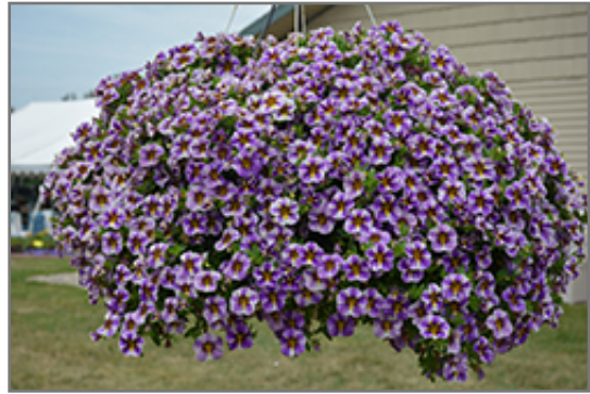
Superbells Holy Smokes! Calibrachoa in bloom

Superbells Holy Smokes! Calibrachoa will grow to be about 10 inches tall at maturity, with a spread of 24 inches. When grown in masses or used as a bedding plant, individual plants should be spaced approximately 12 inches apart. Its foliage tends to remain low and dense right to the ground. This fast-growing annual will normally live for one full growing season, needing replacement the following year.