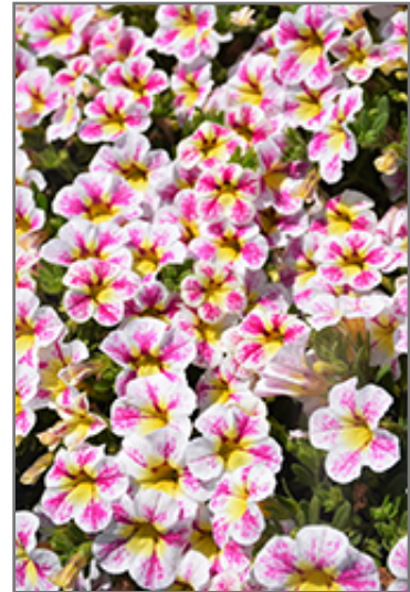
Superbells Holy Cow! Calibrachoa flowers

This plant will require occasional maintenance and upkeep. Trim off the flower heads after they fade and die to encourage more blooms late into the season. It is a good choice for attracting bees and hummingbirds to your yard, but is not particularly attractive to deer who tend to leave it alone in favor of tastier treats. It has no significant negative characteristics.