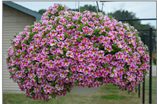
Superbells Holy Cow! Calibrachoa in bloom

Superbells Holy Cow! Calibrachoa is a fine choice for the garden, but it is also a good selection for planting in outdoor containers and hanging baskets. Because of its trailing habit of growth, it is ideally suited for use as a 'spiller' in the 'spiller-thriller-filler' container combination; plant it near the edges where it can spill gracefully over the pot. Note that when growing plants in outdoor containers and baskets, they may require more frequent waterings than they would in the yard or garden.