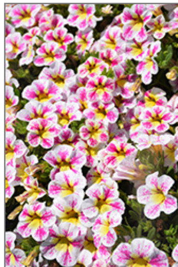
Superbells Holy Cow! Calibrachoa flowers

This plant will require occasional maintenance and upkeep. Trim off the flower heads after they fade and die to encourage more blooms late into the season. It is a good choice for attracting bees and hummingbirds to your yard, but is not particularly attractive to deer who tend to leave it alone in favor of tastier treats. It has no significant negative characteristics.