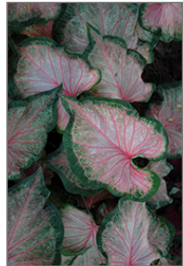
Heart to Heart Chinook Caladium foliage