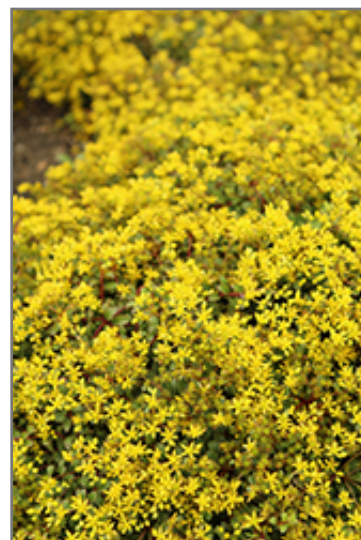
Rock 'N Low Yellow Brick Road Stonecrop flowers

Rock 'N Low Yellow Brick Road Stonecrop is recommended for the following landscape applications;