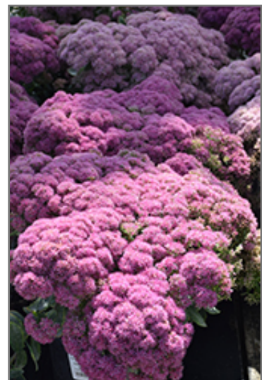
Powderpuff Stonecrop flowers