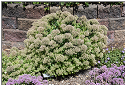
Powderpuff Stonecrop in bloom

Powderpuff Stonecrop will grow to be about 8 inches tall at maturity, with a spread of 18 inches. When grown in masses or used as a bedding plant, individual plants should be spaced approximately 16 inches apart. Its foliage tends to remain low and dense right to the ground. It grows at a fast rate, and under ideal conditions can be expected to live for approximately 15 years. As an herbaceous perennial, this plant will usually die back to the crown each winter, and will regrow from the base each spring. Be careful not to disturb the crown in late winter when it may not be readily seen!