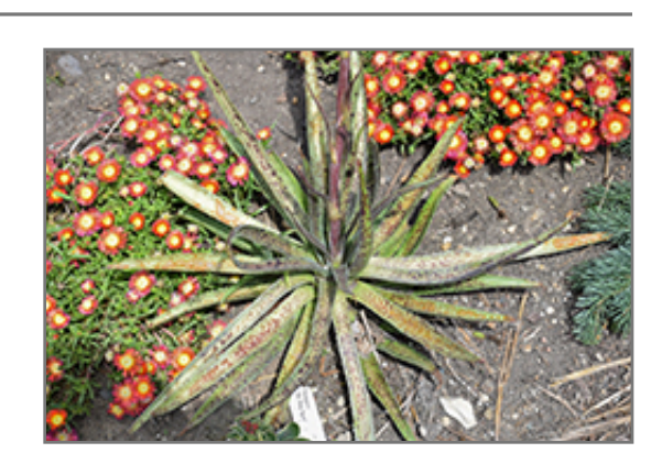
My Dog Spot Mangave

My Dog Spot Mangave will grow to be about 8 inches tall at maturity, with a spread of 16 inches. It grows at a fast rate, and under ideal conditions can be expected to live for approximately 5 years. As an herbaceous perennial, this plant will usually die back to the crown each winter, and will regrow from the base each spring. Be careful not to disturb the crown in late winter when it may not be readily seen!