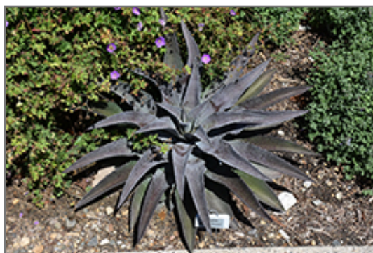
Mayan Queen Mangave