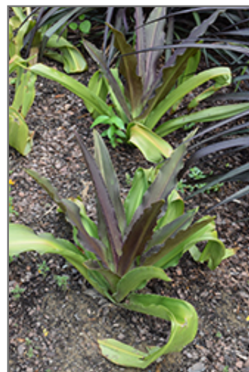
African Night Pineapple Lily

African Night Pineapple Lily is a fine choice for the garden, but it is also a good selection for planting in outdoor pots and containers. With its upright habit of growth, it is best suited for use as a 'thriller' in the 'spiller-thriller-filler' container combination; plant it near the center of the pot, surrounded by smaller plants and those that spill over the edges. It is even sizeable enough that it can be grown alone in a suitable container. Note that when growing plants in outdoor containers and baskets, they may require more frequent waterings than they would in the yard or garden.