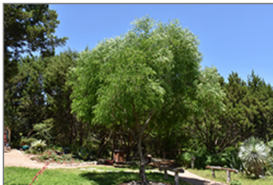
Eve's Necklace