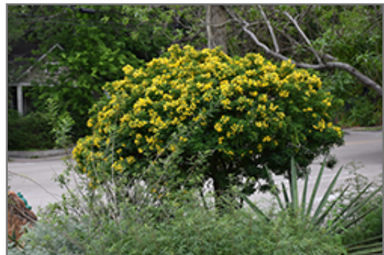
Argentine Senna in bloom