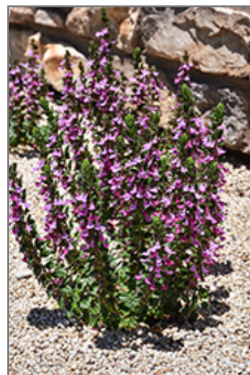
Pink Skullcap in bloom