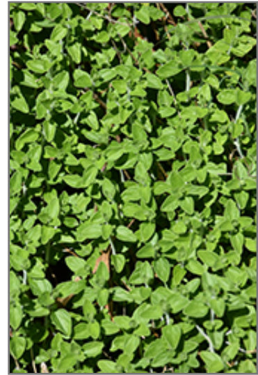
Pink Skullcap foliage

Pink Skullcap is a fine choice for the garden, but it is also a good selection for planting in outdoor pots and containers. Because of its spreading habit of growth, it is ideally suited for use as a 'spiller' in the 'spiller-thriller-filler' container combination; plant it near the edges where it can spill gracefully over the pot. Note that when growing plants in outdoor containers and baskets, they may require more frequent waterings than they would in the yard or garden.