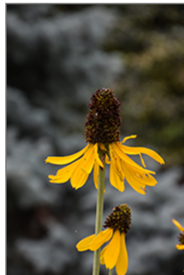
Giant Coneflower flowers

This plant is not reliably hardy in our region, and certain restrictions may apply; contact the store for more information.