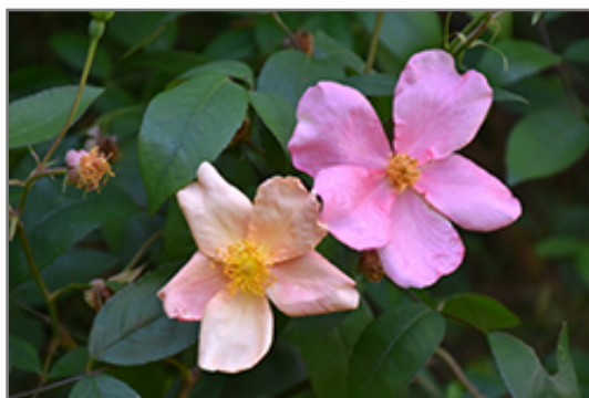
China Rose flowers