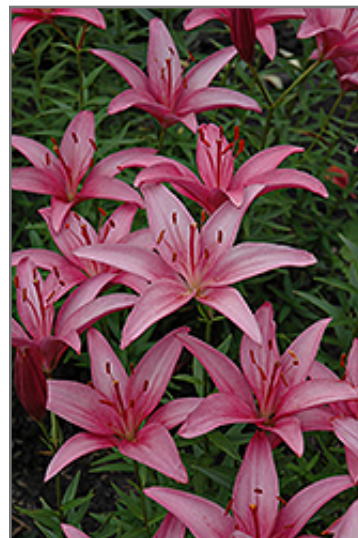
Malta Lily flowers

Malta Lily features bold lavender trumpet-shaped flowers with rose overtones at the ends of the stems in early summer. The flowers are excellent for cutting. Its narrow leaves remain green in colour throughout the season.