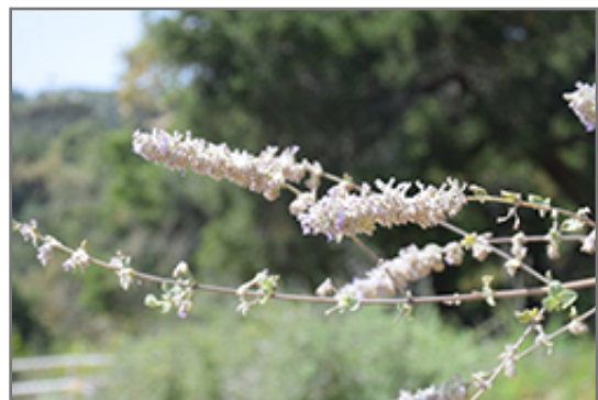
Desert Lavender flowers