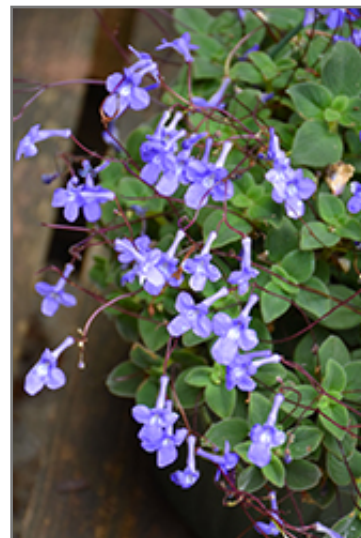
Concord Blue Cape Primrose flowers

This plant does best in partial shade to shade. It prefers to grow in average to moist conditions, and shouldn't be allowed to dry out. It is not particular as to soil pH, but grows best in rich soils. It is somewhat tolerant of urban pollution. This is a selected variety of a species not originally from North America. It can be propagated by cuttings; however, as a cultivated variety, be aware that it may be subject to certain restrictions or prohibitions on propagation.