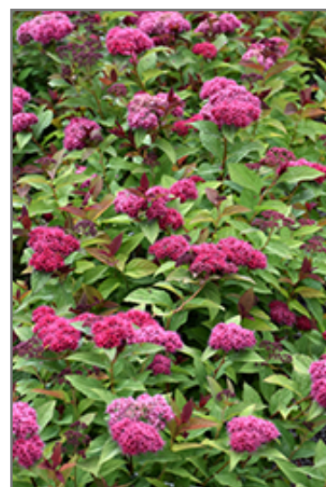
Double Play Doozie Spirea flowers