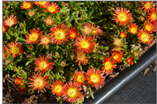
Delmara Red Ice Plant flowers

Delmara Red Ice Plant will grow to be only 4 inches tall at maturity extending to 6 inches tall with the flowers, with a spread of 15 inches. When grown in masses or used as a bedding plant, individual plants should be spaced approximately 12 inches apart. Its foliage tends to remain low and dense right to the ground. It grows at a fast rate, and under ideal conditions can be expected to live for approximately 5 years. As an evergreen perennial, this plant will typically keep its form and foliage year-round.