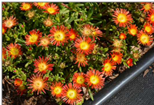
Delmara Red Ice Plant flowers

Delmara Red Ice Plant will grow to be only 4 inches tall at maturity extending to 6 inches tall with the flowers, with a spread of 15 inches. When grown in masses or used as a bedding plant, individual plants should be spaced approximately 12 inches apart. Its foliage tends to remain low and dense right to the ground. It grows at a fast rate, and under ideal conditions can be expected to live for approximately 5 years. As an evergreen perennial, this plant will typically keep its form and foliage year-round.