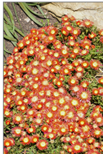
Delmara Red Ice Plant

Delmara Red Ice Plant is recommended for the following landscape applications;