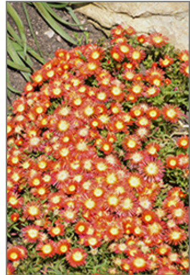
Delmara Red Ice Plant

Delmara Red Ice Plant is recommended for the following landscape applications;