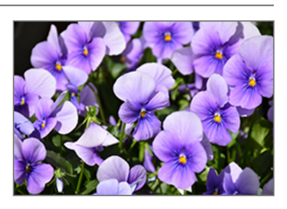
Sorbet Icy Blue Pansy flowers