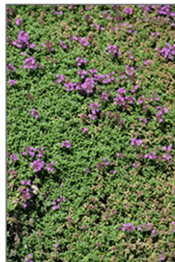
Creeping Thyme in bloom

Creeping Thyme is recommended for the following landscape applications;