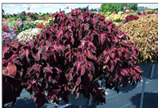
PartyTime Pink Fizz Coleus