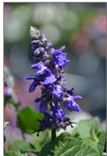
Big Blue Salvia flowers