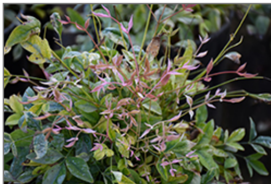
Twilight Nandina foliage Photo courtesy of NetPS Plant Finder

Twilight Nandina is recommended for the following landscape applications;