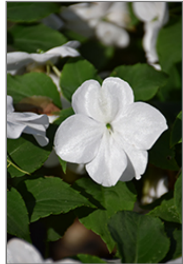
Beacon White Impatiens flowers

Beacon White Impatiens is recommended for the following landscape applications;