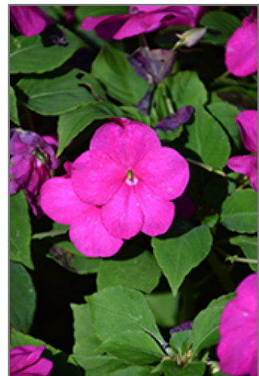
Beacon Violet Shades Impatiens flowers