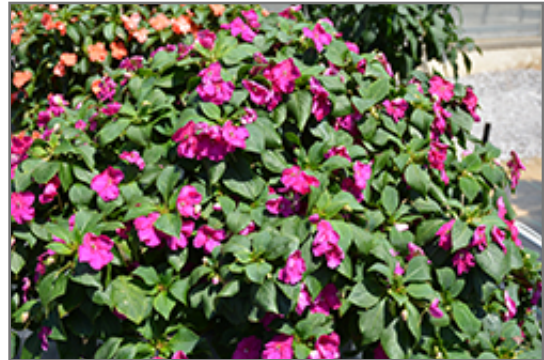
Beacon Violet Shades Impatiens in bloom

Beacon Violet Shades Impatiens will grow to be about 15 inches tall at maturity, with a spread of 12 inches. When grown in masses or used as a bedding plant, individual plants should be spaced approximately 8 inches apart. Its foliage tends to remain dense right to the ground, not requiring facer plants in front. This fast-growing annual will normally live for one full growing season, needing replacement the following year.