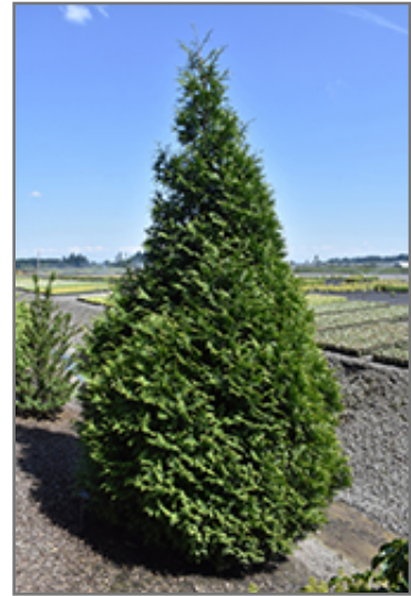
Tiny Tower Arborvitae

Tiny Tower Arborvitae will grow to be about 20 feet tall at maturity, with a spread of 5 feet. It has a low canopy, and is suitable for planting under power lines. It grows at a slow rate, and under ideal conditions can be expected to live for 50 years or more.