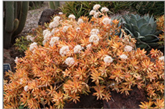
Firestorm Stonecrop in bloom

Firestorm Stonecrop is recommended for the following landscape applications;