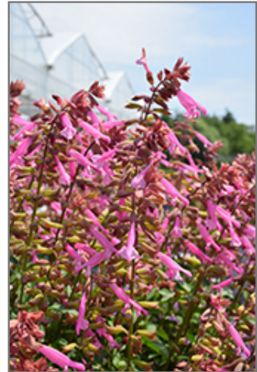
Skyscraper Pink Salvia flowers

Skyscraper Pink Salvia is an herbaceous annual with an upright spreading habit of growth. Its relatively fine texture sets it apart from other garden plants with less refined foliage.