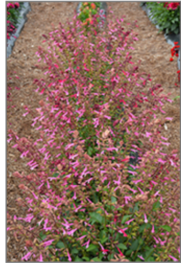
Skyscraper Pink Salvia in bloom

Skyscraper Pink Salvia is a fine choice for the garden, but it is also a good selection for planting in outdoor pots and containers. With its upright habit of growth, it is best suited for use as a 'thriller' in the 'spiller-thriller-filler' container combination; plant it near the center of the pot, surrounded by smaller plants and those that spill over the edges. Note that when growing plants in outdoor containers and baskets, they may require more frequent waterings than they would in the yard or garden.