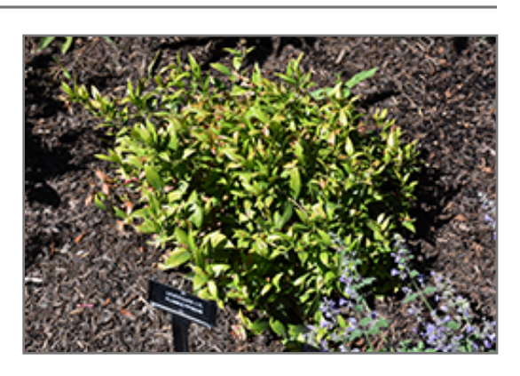
Leafscape Little Flames Fetterbush

Leafscape Little Flames Fetterbush is recommended for the following landscape applications;