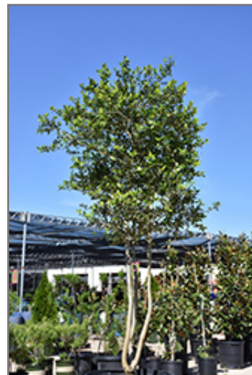
Shadow's Female Yaupon Holly

Shadow's Female Yaupon Holly will grow to be about 12 feet tall at maturity, with a spread of 12 feet. It tends to fill out right to the ground and therefore doesn't necessarily require facer plants in front, and is suitable for planting under power lines. It grows at a medium rate, and under ideal conditions can be expected to live for approximately 25 years.