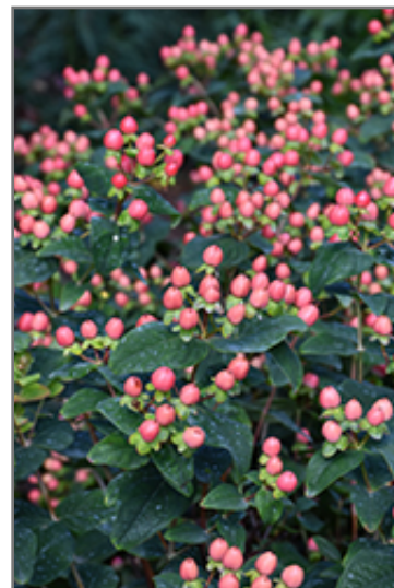
FloralBerry Rosé St. John's Wort fruit

FloralBerry Rosé St. John's Wort is recommended for the following landscape applications;