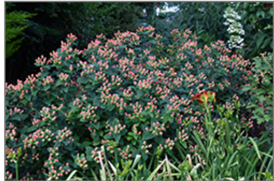
FloralBerry Rosé St. John's Wort fruit

FloralBerry Rosé St. John's Wort will grow to be about 3 feet tall at maturity, with a spread of 3 feet. It tends to fill out right to the ground and therefore doesn't necessarily require facer plants in front. It grows at a medium rate, and under ideal conditions can be expected to live for approximately 5 years. This is a self-pollinating variety, so it doesn't require a second plant nearby to set fruit.