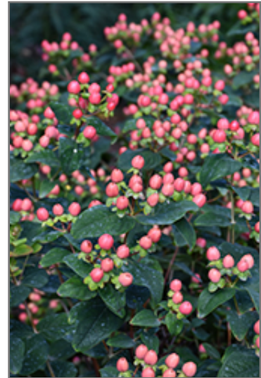
FloralBerry Rosé St. John's Wort fruit

FloralBerry Rosé St. John's Wort is recommended for the following landscape applications;