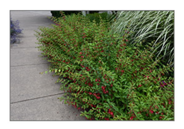
Hardy Fuchsia in bloom