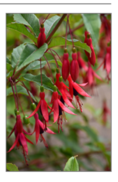
Hardy Fuchsia flowers