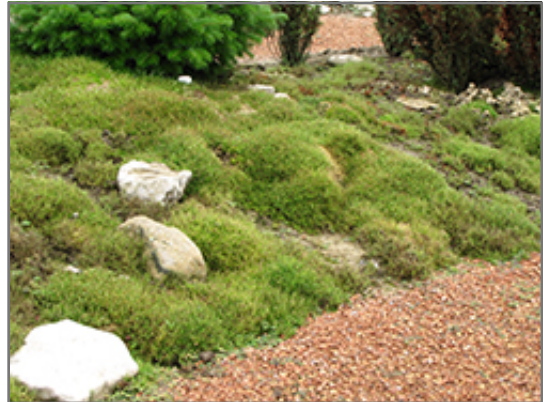
Irish Moss

This plant is not reliably hardy in our region, and certain restrictions may apply; contact the store for more information.