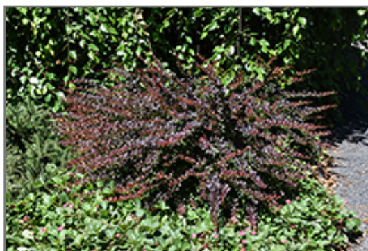
Lava Nugget Barberry

Lava Nugget Barberry is recommended for the following landscape applications;