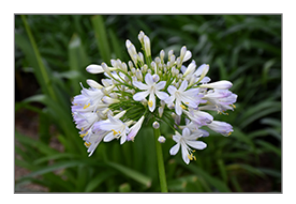
Queen Mum Agapanthus flowers

foliage; long lasting, elegant white flowers with blue eyes appear in summer on tall stems; perfect as an accent plant in the garden or massed along borders