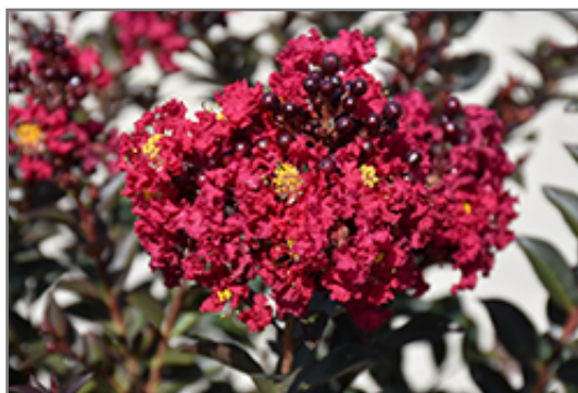
Double Feature Crapemyrtle flowers