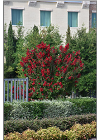
Double Dynamite Crapemyrtle in bloom

This plant is not reliably hardy in our region, and certain restrictions may apply; contact the store for more information.